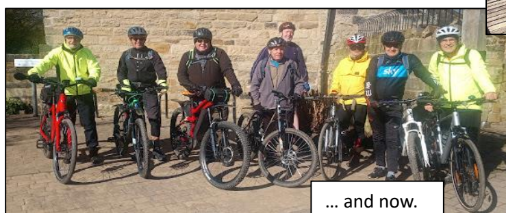
... and now.