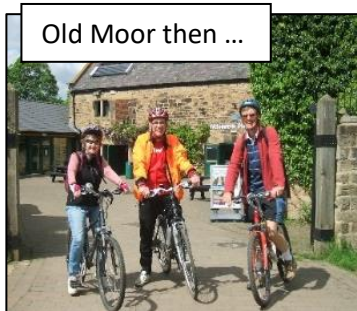
Old Moor then ...