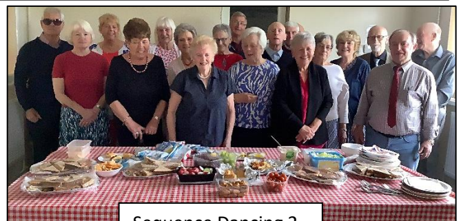
Sequence Dancing 2