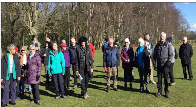
Bu3a and Lytham u3a walkers